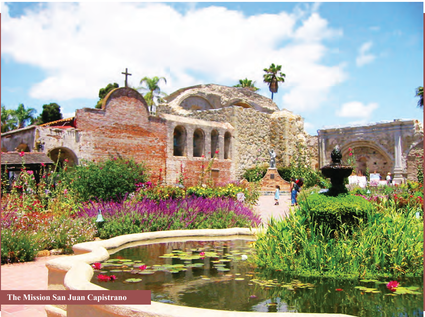
The Mission San Juan Capistrano