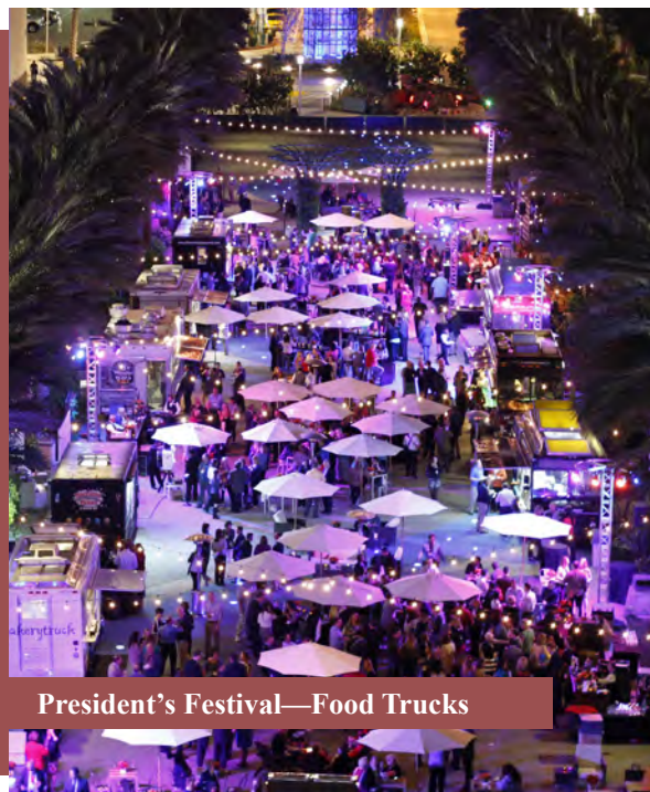
President’s Festival—Food Trucks

Get ready for a celebration just steps away from the hotel. We are staging an adventure outdoors for the kid in all of us. We’ll have music and dancing, action games, gourmet foodie trucks, and more fun surprises. St. Francis Vineyards will be on hand to feature its award winning wine at an informal tasting, and perhaps a visitor from a nearby park will be there to greet you. Your all inclusive pass (which includes drinks and food) is $45 per person. The truly young—anyone under 12 years of age—is free.